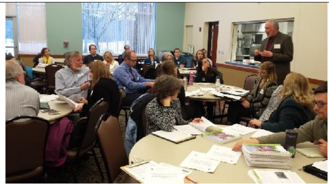
Our Anoka County Workshop, January 2016