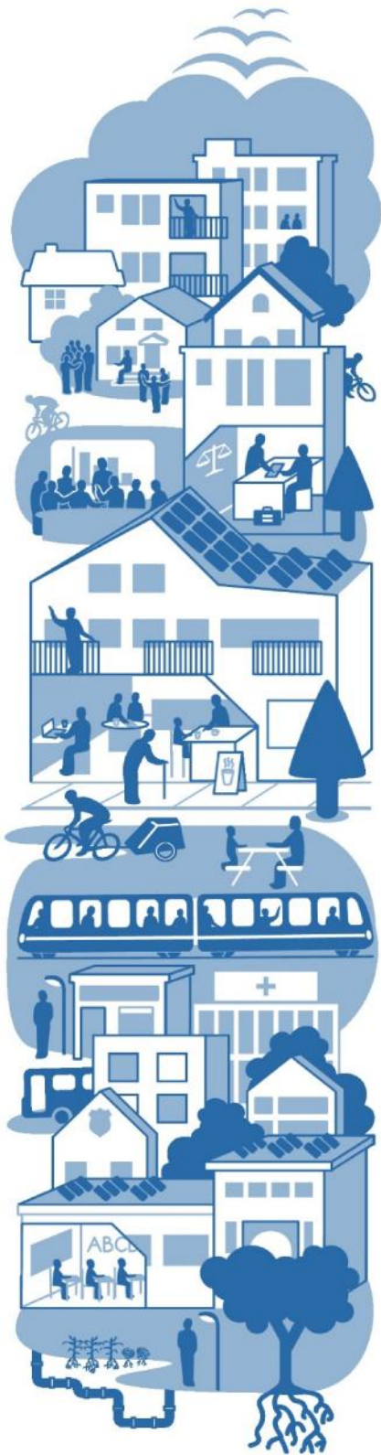
Adopted by the Minneapolis City Council April 14, 2017